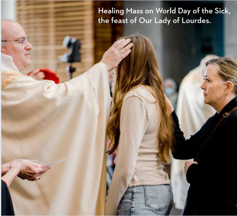
Healing Mass on World Day of the Sick, the feast of Our Lady of Lourdes.