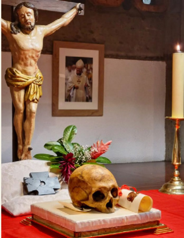
The skull and other relics of St. Thomas Aquinas were unveiled for the 700th anniversary of his canonization at the Dominican Convent of Toulouse, France.

The Dominicans are currently celebrating the triple jubilee of St. Thomas Aquinas! This year marks the 700th anniversary of the canonization of Aquinas (July 18). In 2024, we commemorate the 750th jubilee of Aquinas' death (March 7). And in 2025, we commemorate the 800th anniversary of his birth (January 28). This triple jubilee celebration is an opportunity for many blessings. As such, the Holy See has granted a plenary indulgence "to the properly disposed faithful who will participate in the Eucharistic celebrations organized by the Dominican Family in our churches and schools on the important occasions of the jubilee of the canonization and death of St. Thomas Aquinas, and to the faithful who will make pilgrimages to Churches, shrines and oratories under his patronage." This triple jubilee and the indulgences associated with it run from now through 28 January 2025.