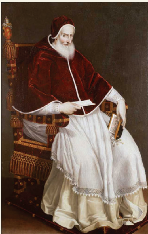
Pictured: St. Pope Pius V

—St. Dominic writing to the nuns of Madrid