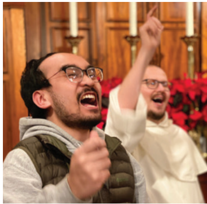
When you love Jesus, sometimes you just have to sing!

To download the album, go to opwest.org/soulofchristalbum .